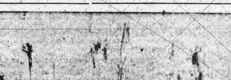
A battery of self-propelled mortar fires a salvo at Japanese positions on Bink island, off the coast of Dutch New Guinea.